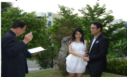
Solemnization of marriage at Hort Park

I have been authorised by the MCYS to solemnise marriages in Singapore since July this year. We had thus far, solemnised 12 couples who had attended at least three hours of premarital sessions conducted by the centre. Our premarital sessions focus on helping couples to understand God's blueprint of marriage, management of conflicting traits and the growth process of a married life. I am glad to note that those who attended our session had been receptive to our counsel and some had accepted the Lord as their personal Saviour and had even begun to attend church. We thank God that He has opened up a new avenue for us to share our beliefs in healthy marriages especially with couples who have no Christian partners.