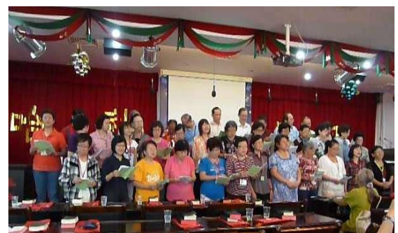
Presenting Song Item @ Halleluiah Church in Haikou

Our participants seemed to enjoy every talk and workshop session of the camp. Most of them shared freely by following the guidelines for sharing. It helped us to get to know one another better. It inspired most of us to affirm our position and value as senior adults and to rededicate our lives for the service of the Lord. It encouraged us to live a happy and meaningful life. All our activities in the camp had been inspiring and we felt the presence of the Holy Spirit. The few days of our Hainan Island tour had been a joyous experience to me. Though we encountered a typhoon, we experienced the protecting hands of God. Praise the Lord.