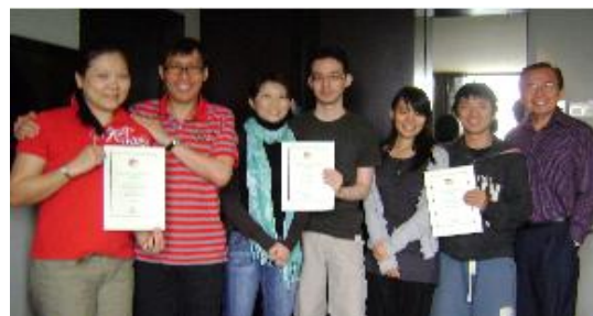
Courting Couple Course

After the Self-awareness Course those who are married may be encouraged to continue the programme with the Marriage Enrichment Course. If their spouses including pre-believers have not been attending the course with them, they may be invited to join a Marriage Enrichment camp which may be more appealing to them. They may form a Covenant Family Group after their course or camp. The course aims at helping them to love their neighbours (spouses) as themselves. They normally develop a trust relation in the process of sharing their spousal relationship in the group. It will motivate them including the pre-believers to continue staying together as a covenanted support group. It will then be sustained by the trust and care of one another in the group and sharing of insights gathered from the Guide to Christian Family Life in their weekly meetings. Ultimately they will come to the stage of using the Family Altar Series to equip themselves for the ministry of building up the body of Christ through leading their family altar. If the participants of the Self-awareness Course were singles, they can continue their group experience through weekly sharing from the Guide to Christian Family Life . This is an important step of preparing group members for the challenge of Christian marriage and family life.