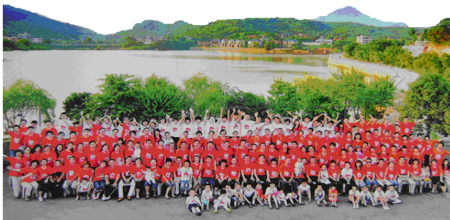
Parenting Camp in FuZhou

As we know, the Senior Adult Ministry has drawn a considerable amount of attention of the mainstream churches in Singapore today. We had, therefore, developed a Senior Adult Life Enrichment programme to meet their needs. Our three-night and two-day camp cum a three-day Hainan Island tour in September proved to be relevant and effective. We rejoiced to see that it had enriched the marriages and lives of the 45 participants. Most of all, we managed to evangelise intensively to the six pre-believers who joined us during the messages and the fellowship in the camp.