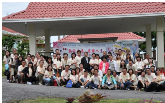
Marriage Enrichment Camp of Taiping Methodist

encouraged that they would like to continue such group meetings in their respective churches. Unfortunately we had not adequately prepared group leaders for such a ministry. We hope to organise more of such programmes next year but this time, with adequately trained workshop leaders to follow-up the campers by forming senior adult life enrichment groups under the purview of the Senior Adult Ministry of their respective churches.