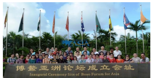
Senior Adult Enrichment Camp at Hainan

This is a more important step to fulfilling our goal of equipping group members for building up the body of Christ through leading the family altar.