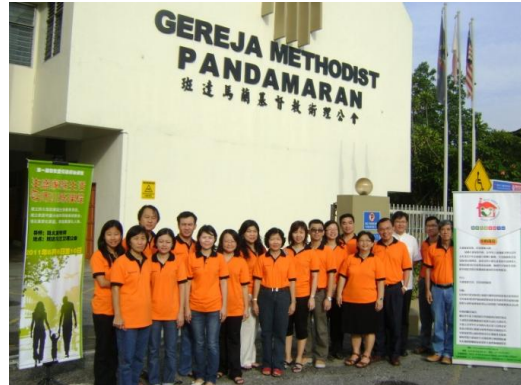
Family Life Ministry Work Team in Malaysia

We believe that a number of pastors had read the article “Call for Enhancing the Shepherding Ministry” published in Oasisflec News2010 that had been mailed to them or found on our website. We rejoiced that some of them had responded positively. This then led us to identify nine interested churches in Malaysia, China and Singapore who stated their interest to enhance their shepherding ministry since the last Advent.